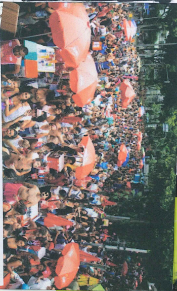
Lots of people joining the street festivals - blocos.

Second, the African slaves also brought their Samba music and dances to Brazil. The Brazilian mix "Entrudo" and Samba music to become the Rio Carnival.