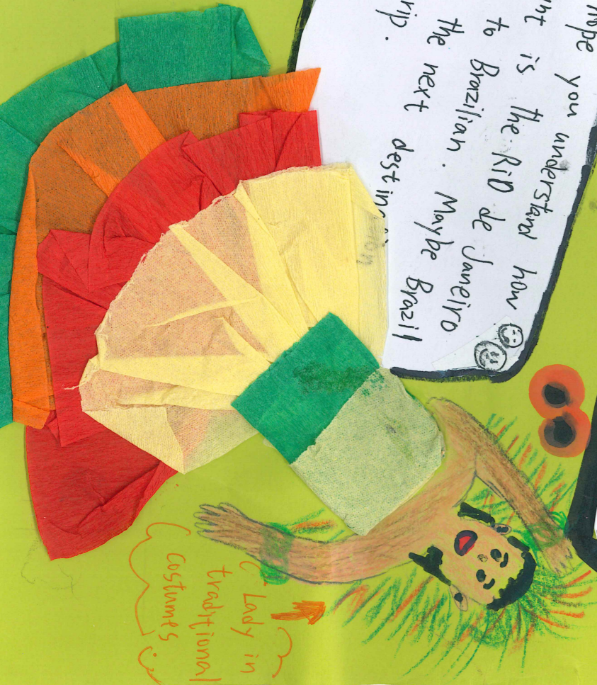
Lady in traditional costumes.